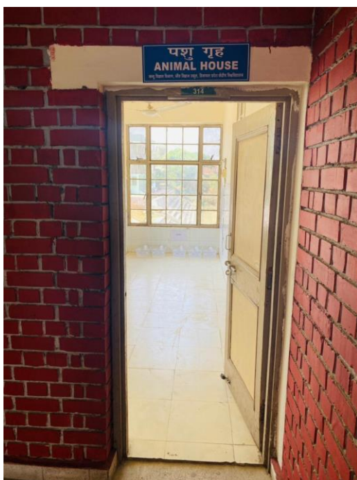
Figure-1: Animal House entrance