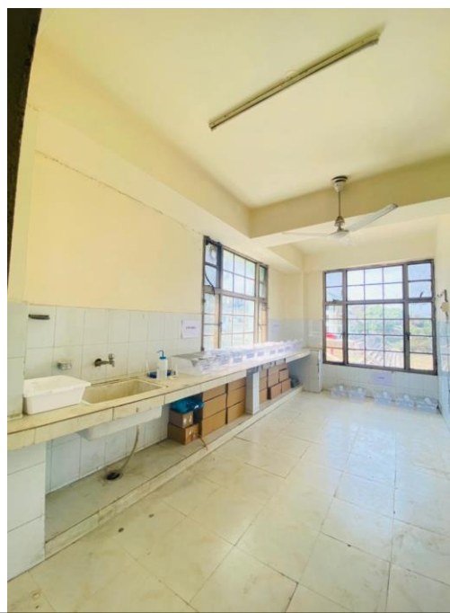
Figure-2: Animal House working area