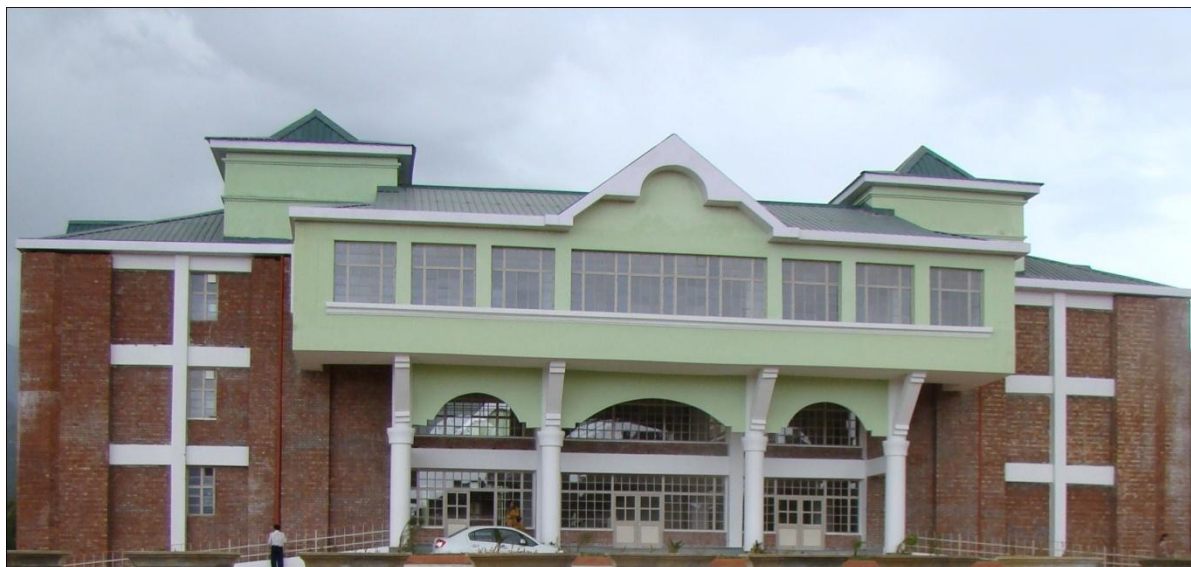
Facade of the TAB at Shahpur

Development of physical facilities and infrastructure for the two campuses of the university may take some time. In the interim, the University shall commence its academic activities from the Temporary Academic Block (TAB) located at Shahpur. The Temporary Academic Block (TAB) will have the following facilities: