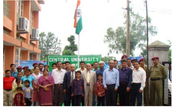
Independence Day Celebration in the University

If this appears interesting and stimulating please read on..... and if you feel like being a part of this innovative initiative..... download and duly fill up the application form and send the same well in time.