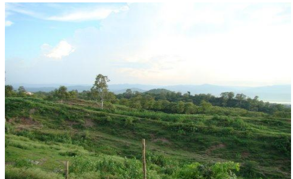
Site for the Beas Campus