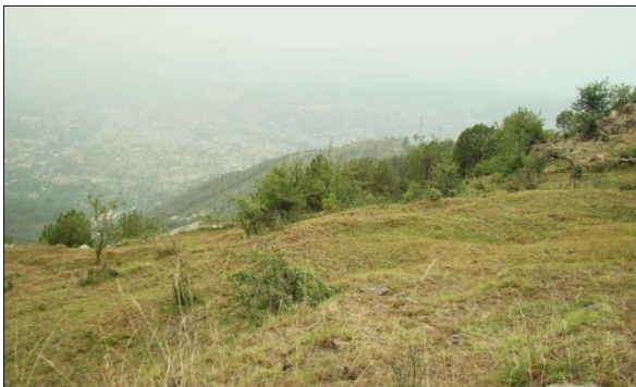
Site for the Dhauladhar Campus