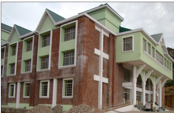
A view of the Temporary Academic Block