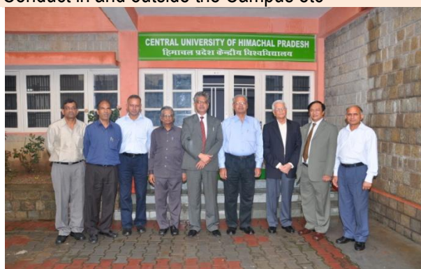
Members & Participants of the first EC

Further details on the curricula and courses for various programmes of studies shall be furnished in the Students' Hand Book, to be issued after admission is completed. The Handbook shall, inter alia, provide Course Catalogue, Course Outline, and Rules relating to Examination, Attendance, Residence and Good Conduct in and outside the Campus etc