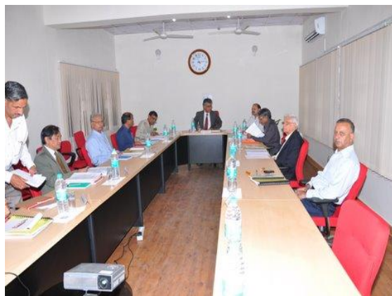
EC Meeting in Progress in the University Board Room

Innovative Programmes & Curricular Framework: Guided by the reforms agenda in higher education and learning from the experiences of the best universities of the world, the University has introduced a number of innovations, as detailed below: