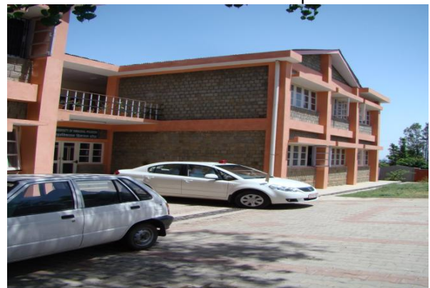
A view of the Camp Office