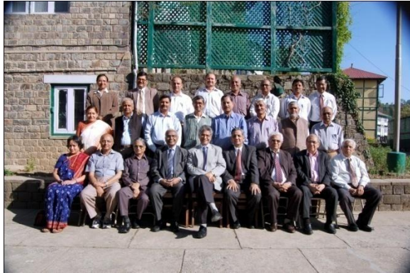
Participants of the Brainstorming Session on Vision of the University