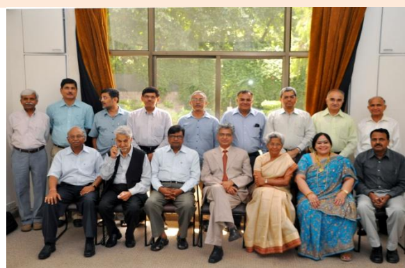
Members & Participants of the first AC