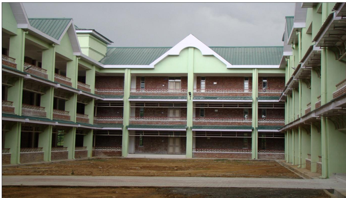
Inner Court of TAB at Shahpur