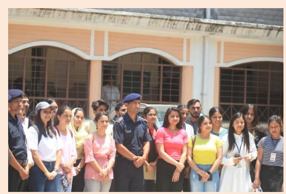
Students during NDRF Disaster Management Training