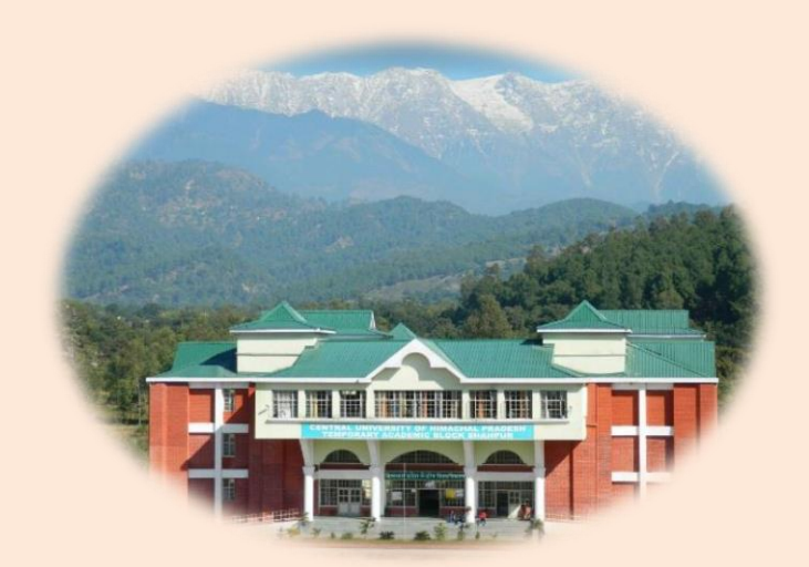
Academic Building Shahpur Parisar, Shahpur

The University is well-connected through air, road & rail networks. The nearest airport is at Gaggal, Dharamshala. The nearest two railway stations are at Pathankot and Amb Andaura.