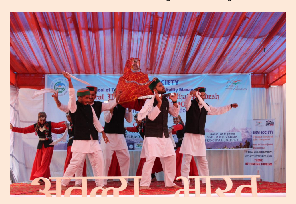
A traditional Himachali folk dance during Tourism Week, 2022 at CUHP, Dharamshala by the students of the university

Different types of cultural and amusement activities are organized by different departments of the university at its own level as per the requirements and emerging needs. The university has made provisions for Cultural Society, a Debating Club, a Music Club, a Nature Club, a Film Club, a Theatre Group, and a Photography Club to provide exposure and experiences of a rich corporate life to the students. The HPKV Business School also organizes its Management Fest "Himspark".