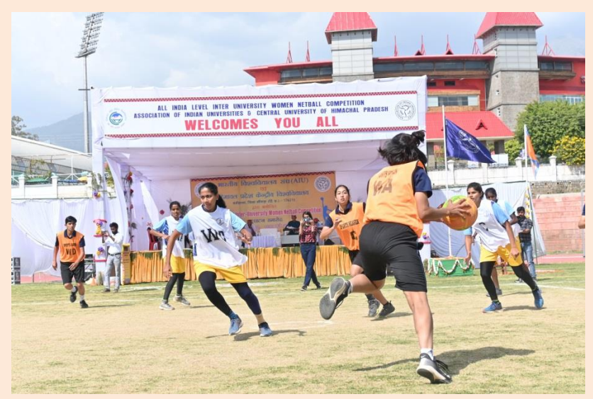
A women's Netball Competition Match under progress