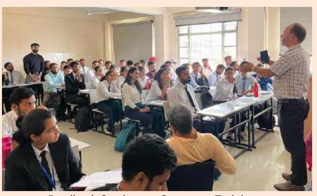
Feedback Session on Corporate Training