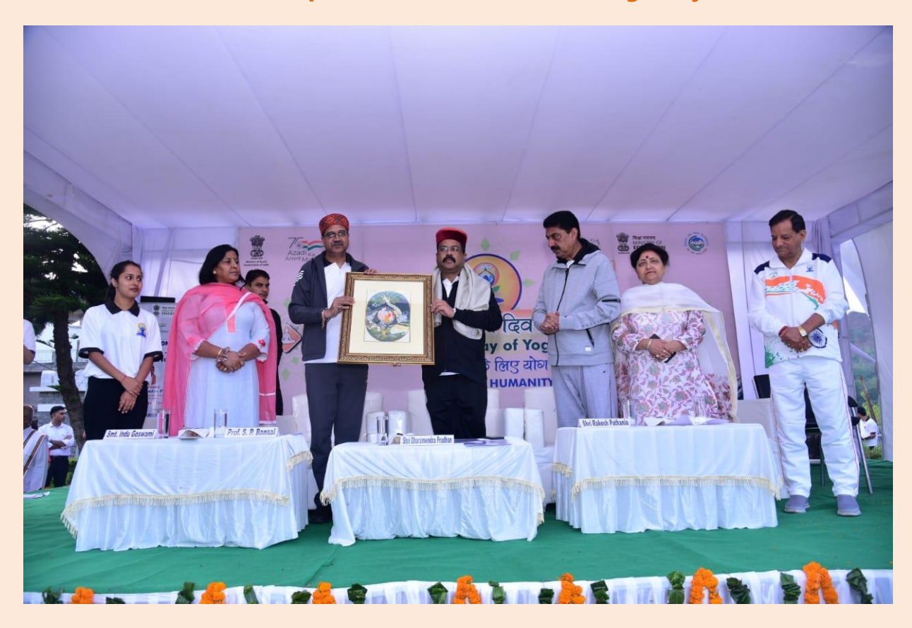
Hon'ble Vice-Chancellor, CUHP presents a Kangra Painting as souvenir to Shri Dharmendra Pradhan, Hon'ble Minister for Education and Skill Development and Entrepreneurship Gol on on International Yoga Day, 2022 at Kangra Fort