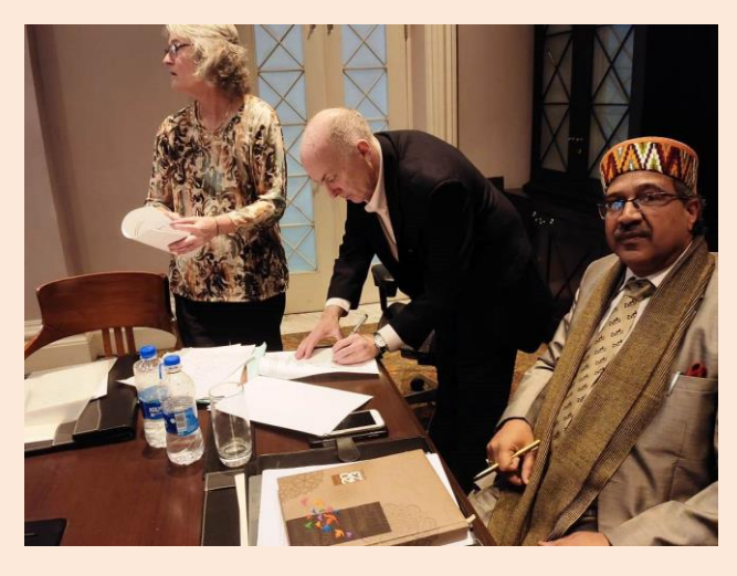
Signing of MoU with Indiana University, Pennsylvania, USA & exchange of documents