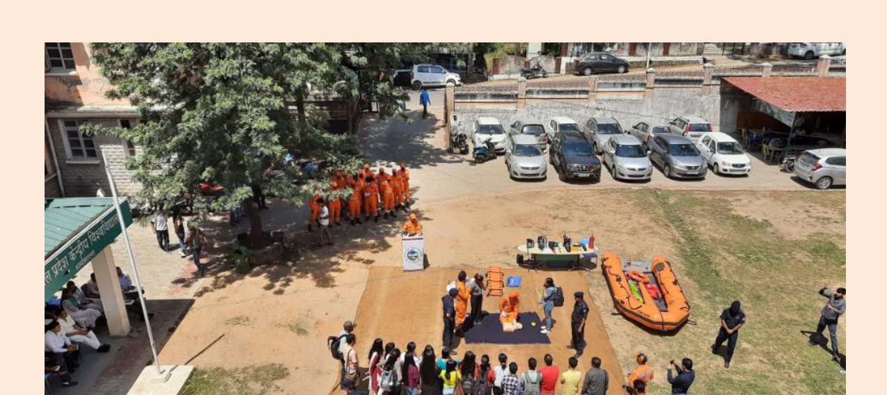
Disaster Management Training by NDRF 14 Battalion Nurpur, HP at Dhauladhar Campus, CUHP, Dharamshala