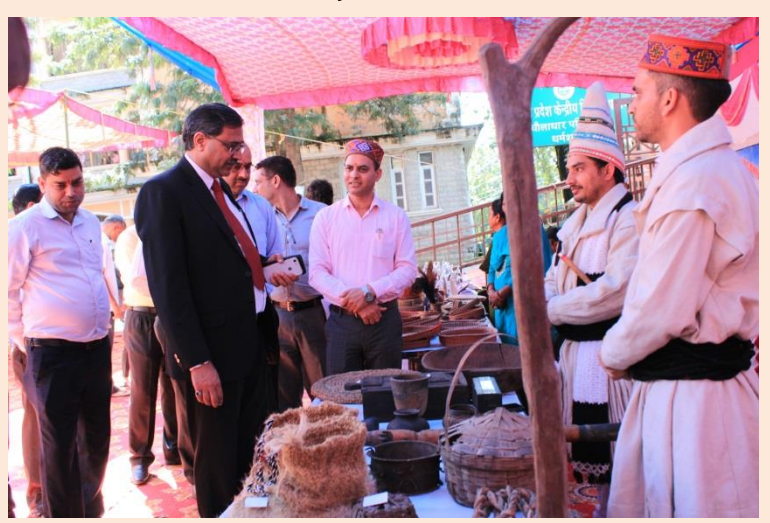
Hon'ble VC, CUHP Prof. Sat Parkash Bansal viewing a stall of local artefacts of Bharmour, Chamba