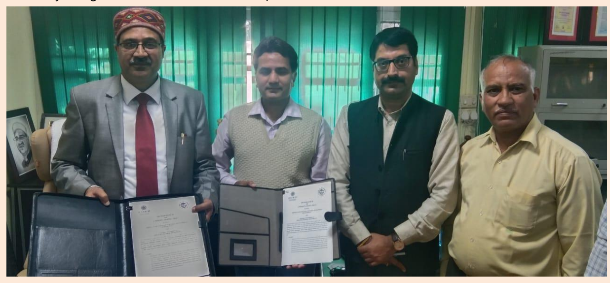
MoU Document Exchange with CORD Dharamshala