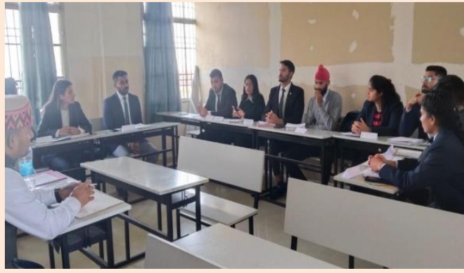
Training Initiative : Group Discussion