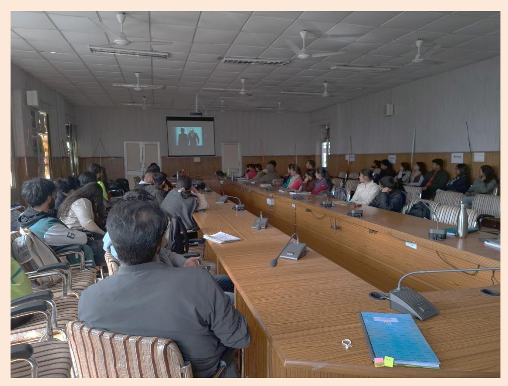
Screening of the film "EXAM (2009)" on 10th February, 2023 by Media Film Club of School of Journalism, Mass Communication & New Media