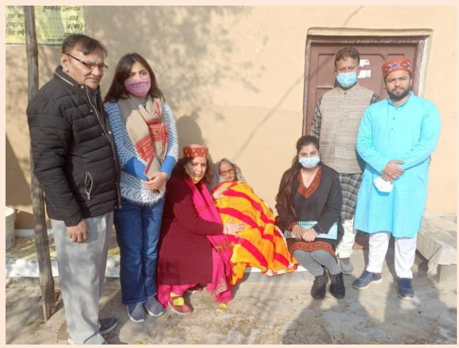
Blanket Distribution in an Identified BPL Family