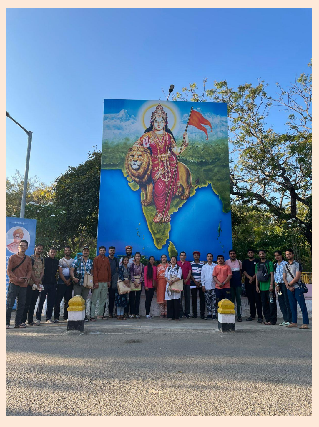
Participants of CUHP (RD Scholars & Students) during International Conference on Yog Philosophy 2023 (Yog Shastra Sangamam 2023) held at Kanyakumari during 24-26 February 2023

Different departments of the university organise Educational Tours and Industrial Visits for the students. These are aimed at exposing the students to the practical aspects of their discipline and sensitise them about the career opportunities and through that process help students chart out their career options and strategies.