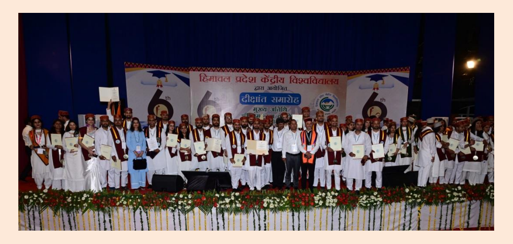
A Group Photo of Degree Recipients during 6<sup>th</sup> Convocation 2022 of CUHP