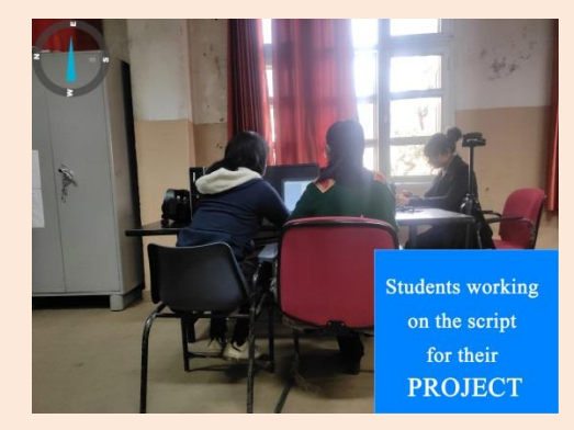
Media Lab Activities