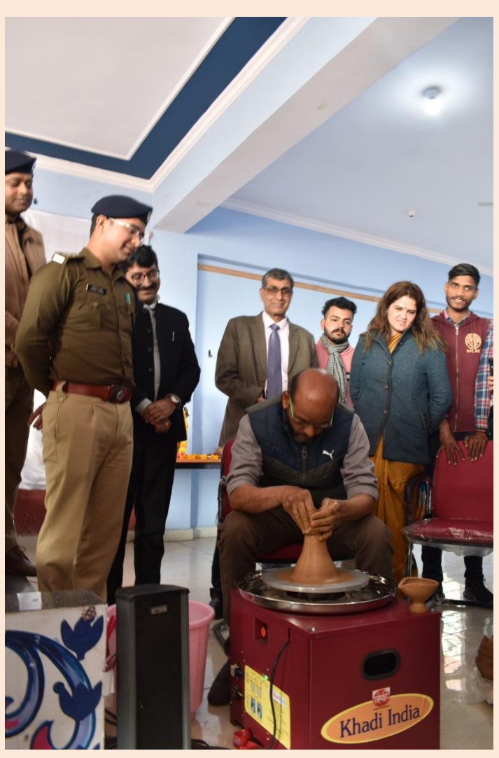
A workshop on pottery making under progress

The school of performing and visual arts is one of the newly established institutions in Fine arts. It offers Bachelor of Fine Arts (Painting and Sculpture) and Master of Fine Arts (Painting) and research programme in visual arts specialized area. The faculty stresses on optimum interaction with standard art activities all over the country. Organizes art exhibitions and etc. the school have committed to popularization, promotion and preservation of Indian modern and contemporary art in H.P. through the Indian philosophy. The school endeavors to produce professionals with creative thinking who can play a positive role in society.