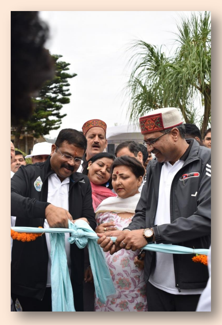
Shri Dharmendra Pradhan, Hon'ble Minister for Education and Skill Development and Entrepreneurship Gol inaugurating Nainsukh Kala Utsav-2022 at Kangra Fort in the presence of Hon'ble Vice-Chancellor, CUHP and other dignitaries.