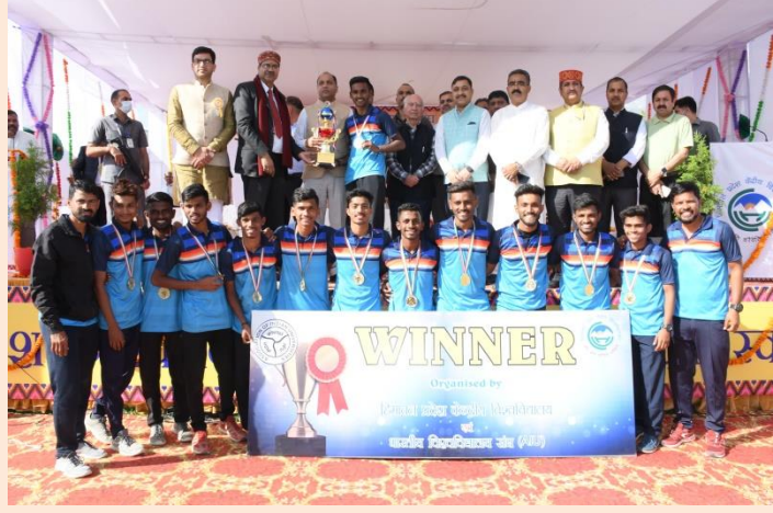
The Chief Guest honouring the winning team Mumbai University at the closing ceremony of the Inter-Zonal Men's Kho-Kho Competition