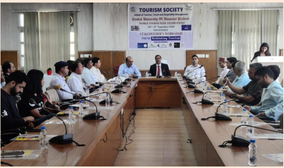
Stakeholders Workshop on the theme 'Rethinking Tourism' being presided by the Hon'ble VC, CUHP during World Tourism Week Celebrations, 2022