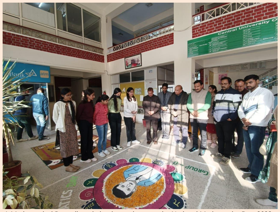
A Mathematical Rangoli made by the students on the National Mathematics Day, 2022