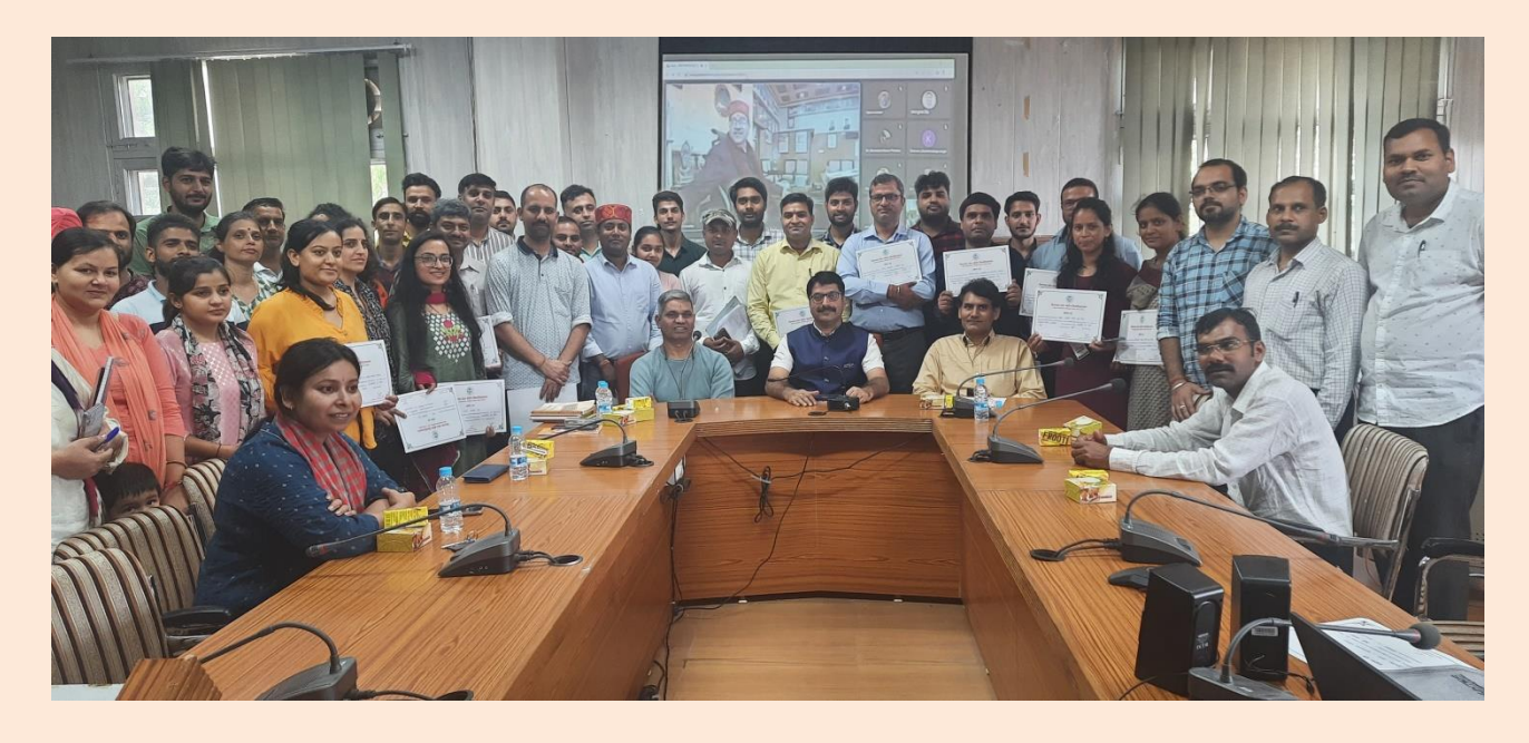
Winners of the competitions organised for RD Scholars, Students, Teachers & Non-Teaching Employees during Hindi Pakhwada, 2022 along with Hon'ble Vice-Chancellor (online), Dean (Academics), Dean School of Languages, HOD, Department of Hindi & other teachers of CUHP

Besides the full-time faculty, the university also invites eminent and experienced academicians, professionals and practitioners to enrich teaching-learning process. This helps in providing quality inputs in teaching and research.