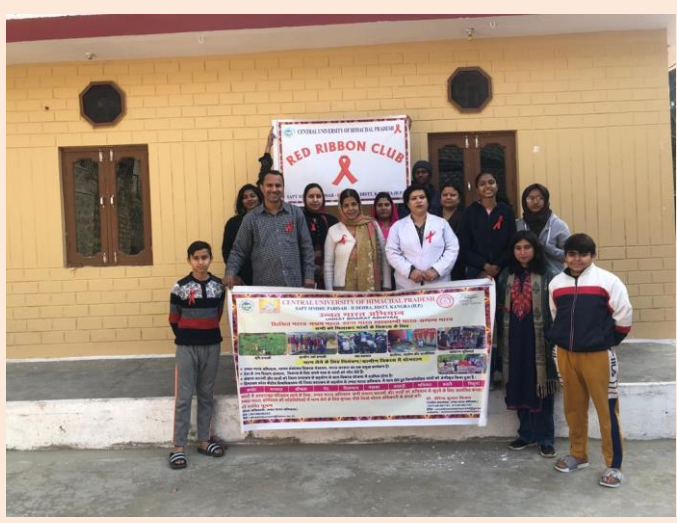
Awareness Program on HIV AIDS at Snot Village