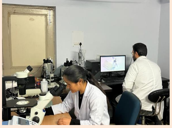
Science Labs at Shahpur Campus