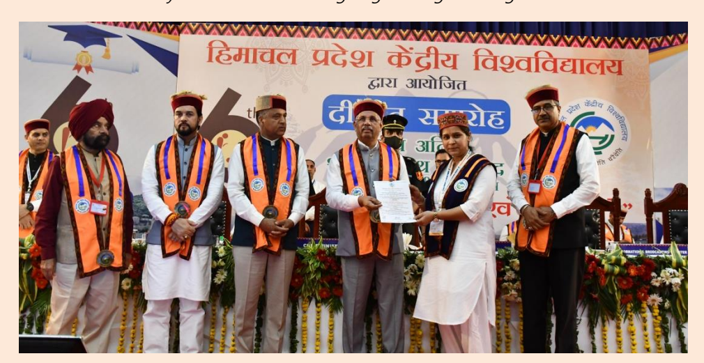
Shri Rajendra Vishwanath Arlekar, the then Hon'ble Governor of HP giving out a degree