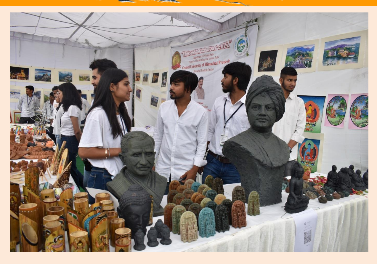
A stall during Nainsukh Kala Utsav-2022 at Kangra Fort by the School of Fine Arts