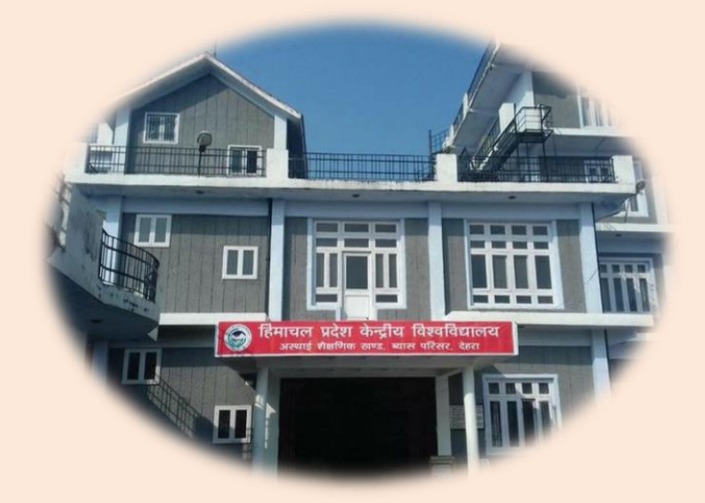
Academic Building Sapt Sindhu Parisar-I, Dehra