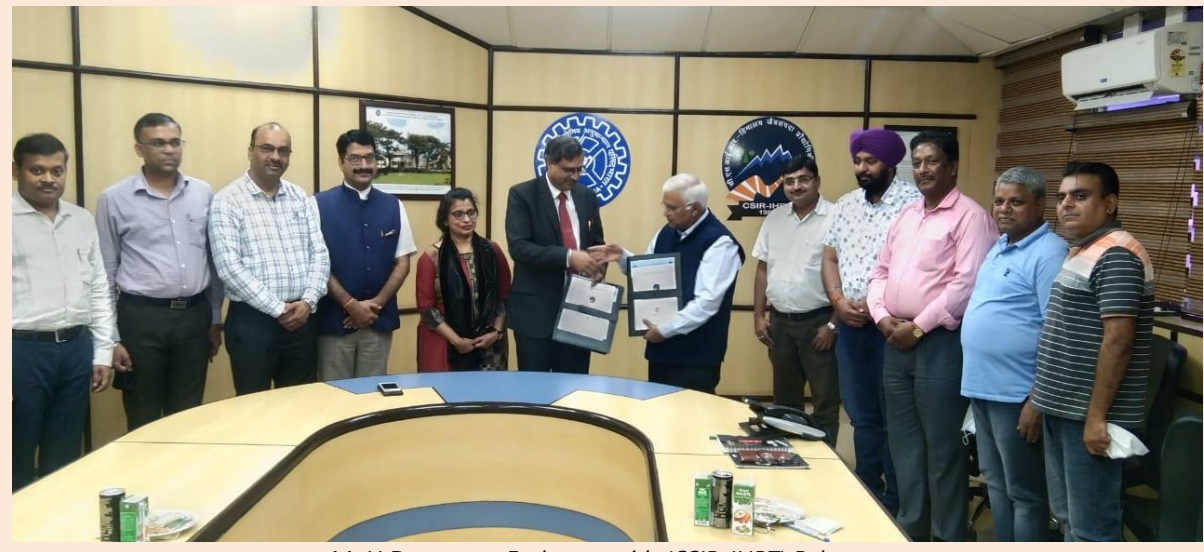
MoU Document Exchange with (CSIR-IHBT) Palampur

26. Department of Journalism & Mass Communication, Univ. of Lucknow (w.e.f. 26.08.2022)