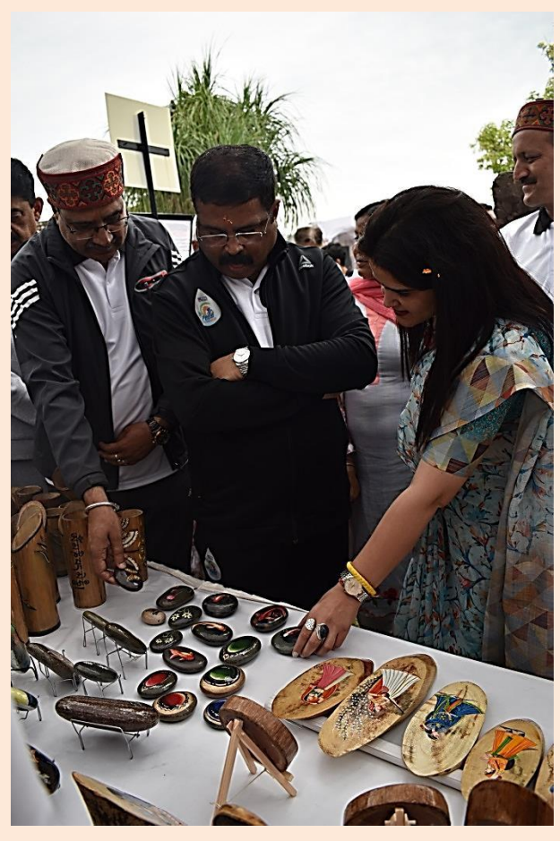
Visit of Shri Dharmendra Pradhan, Hon'ble Minister for Education and Skill Development and Entrepreneurship Gol to a stall of Nainsukh Kala Utsav-2022 at