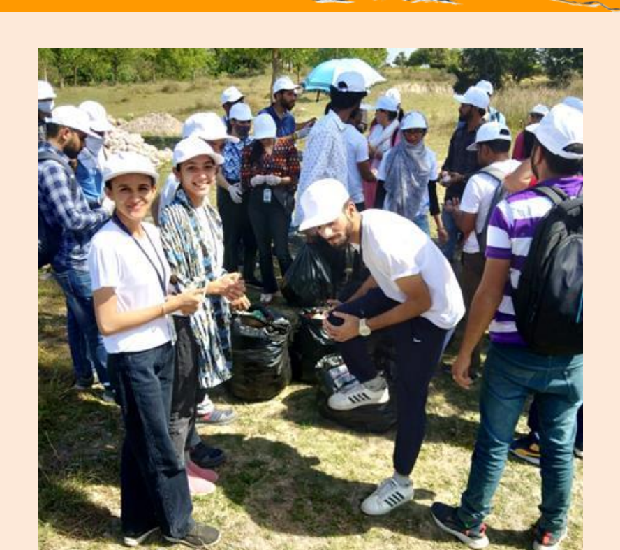
Participant students during Village Cleanliness Drives