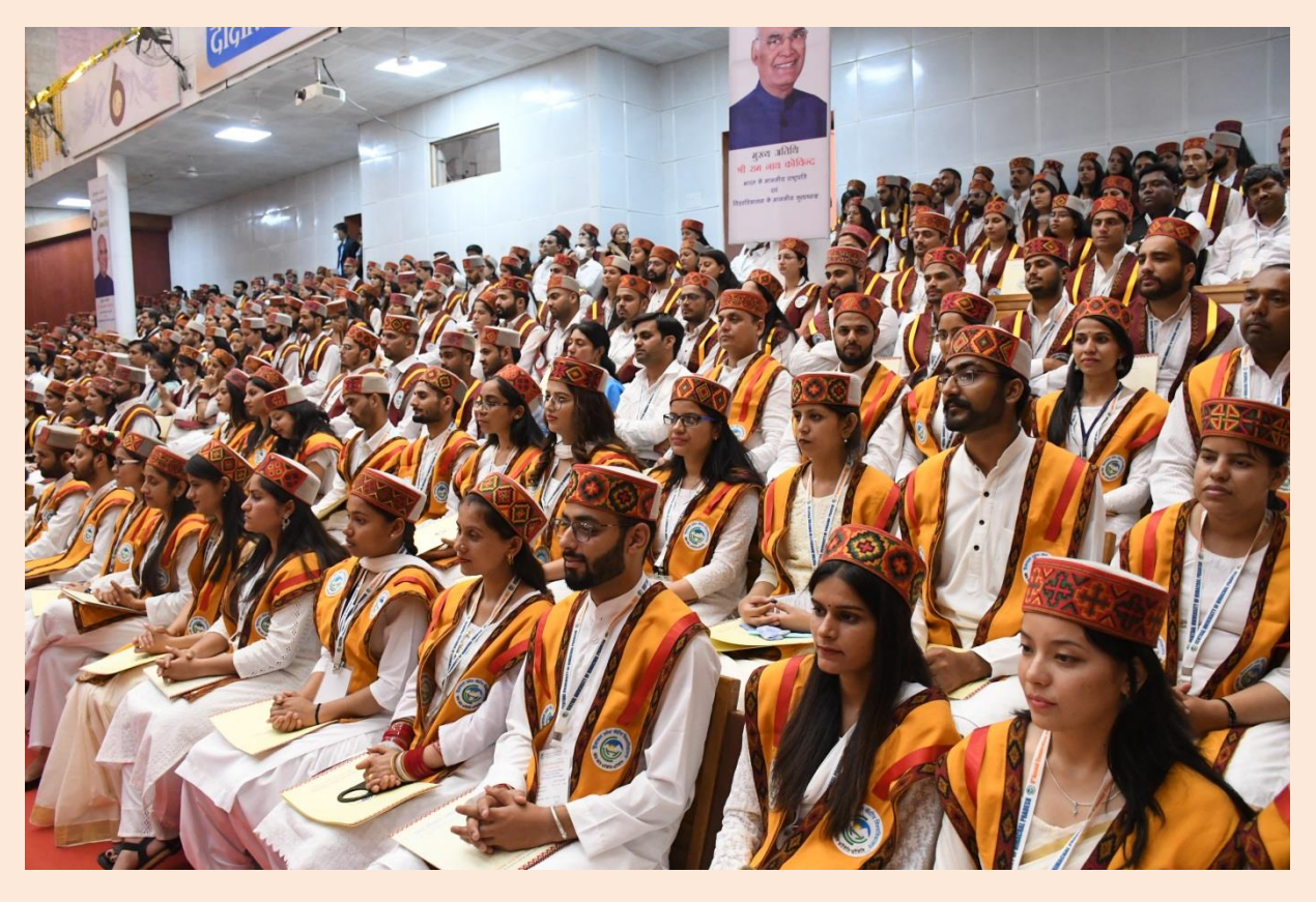
Degree Recipients of CUHP during 6<sup>th</sup> Convocation 2022