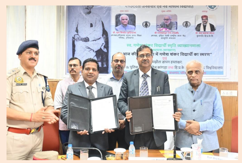
MoU Document Exchange with HP Police Training College Daroh Kangra (HP)