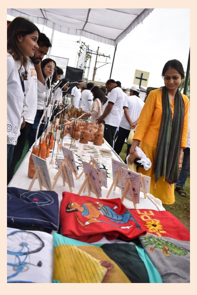
Another stall during Nainsukh Kala Utsav-2022 at Kangra Fort