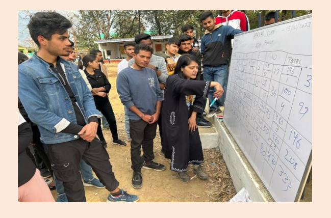
'Rejuvenation" an Activity Based Learning of Leadership Traits, Team Building and Self Develop