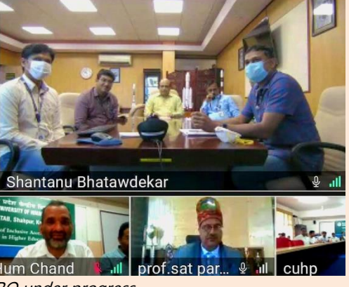
MoU Meeting (online) with ISRO under progress