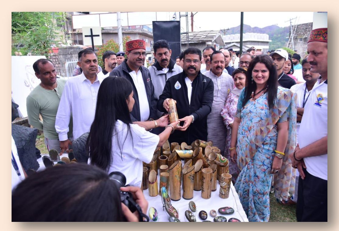
Visit of Shri Dharmendra Pradhan, Hon'ble Minister for Education and Skill Development and Entrepreneurship GoI to another stall of Nainsukh Kala Utsav-2022 at Kangra Fort