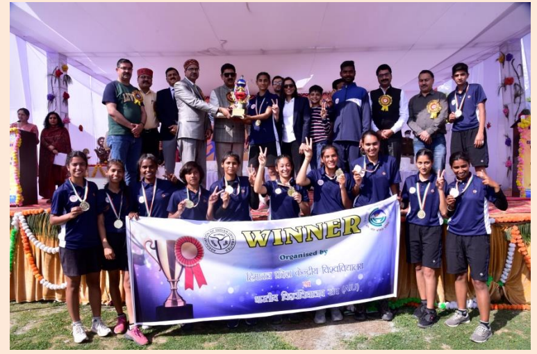
The Chief Guest honouring the winning team Chandigarh University at the closing ceremony of the women's Netball Competition