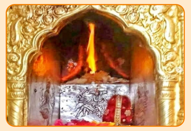
MAA JAWALA JI MANDIR, JAWALAJI