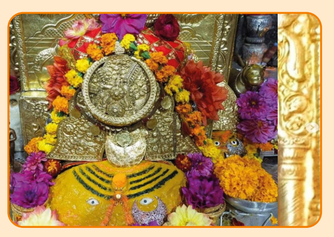
MAA BAJESHWARI DEVI MANDIR, KANGRA