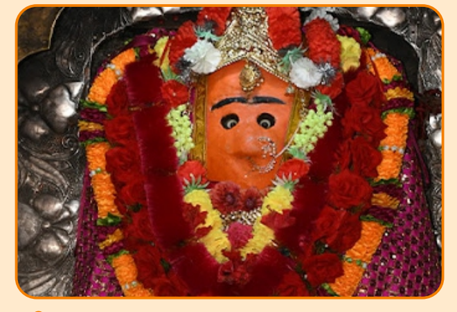
MAA CHAMUNDA DEVI MANDIR CHAMUNDA