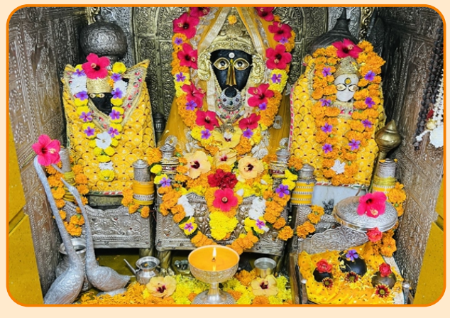
MAA BAGLAMUKHI MANDIR,BANKHNDI