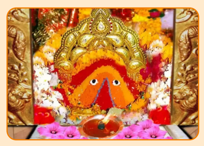
MAA CHINTPURNI MANDIR, CHINTPURNI