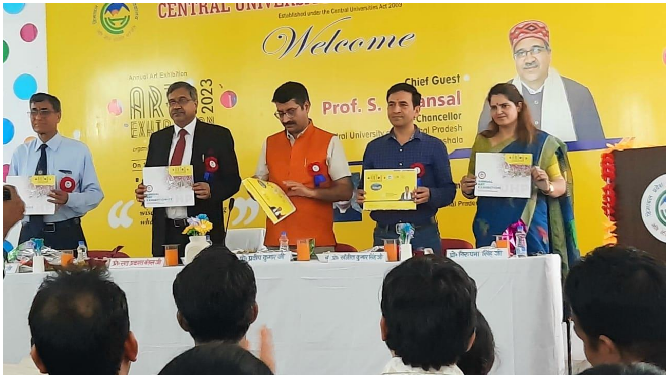
Figure 1 Catalog release