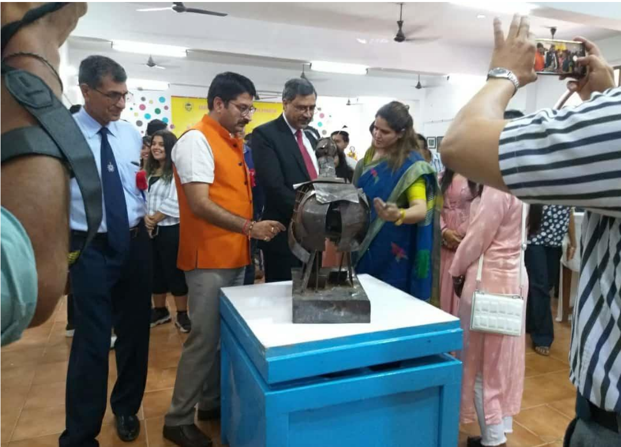
Figure 3 An Art Exhibition Visited by Chief Guest