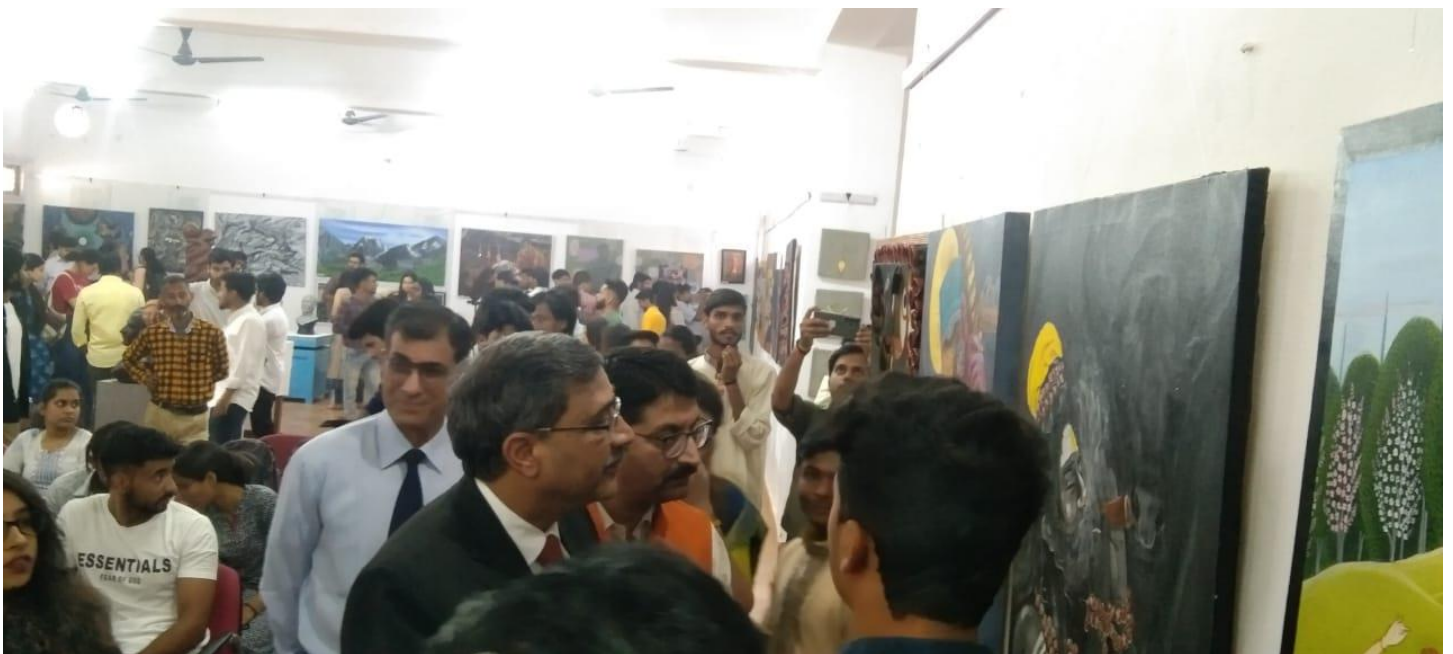
Figure 2 Hon'ble Vice Chancellor, Prof. Sat Prakash Bansal sir interacted with the students