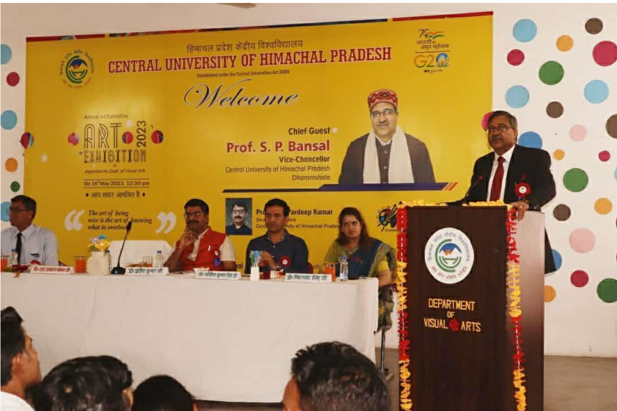
Figure 4 Chief Guest Speech