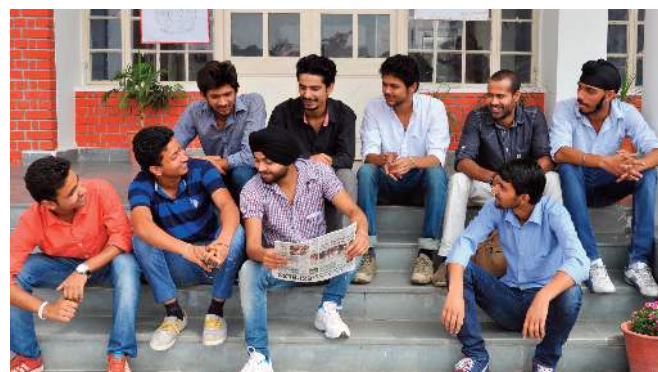
Students from across the country comes together in CUHP campus.

include some words in her conversation with Rajasthani accent, which creates an environment of easiness amongst her friend circle. "I