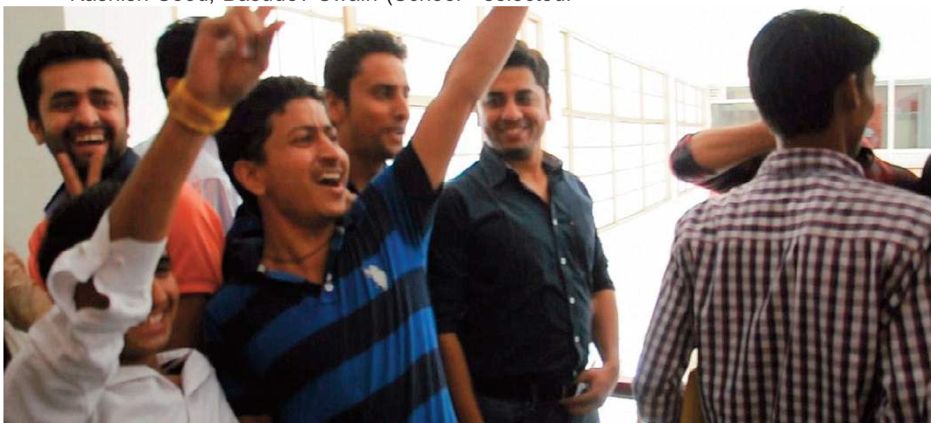
Students of School of MBA celebrate victory as the election results are declared at CUHP on Wednesday.

With the election results declared, student council has got 20 elected members. The remaining 20 members, who are nominated based on academic performance, will be shortly selected.