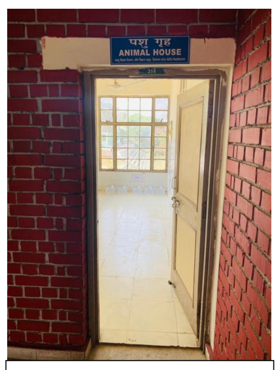
Figure-1: Animal House entrance