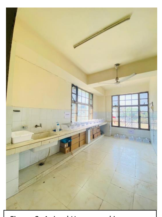
Figure-2: Animal House working area