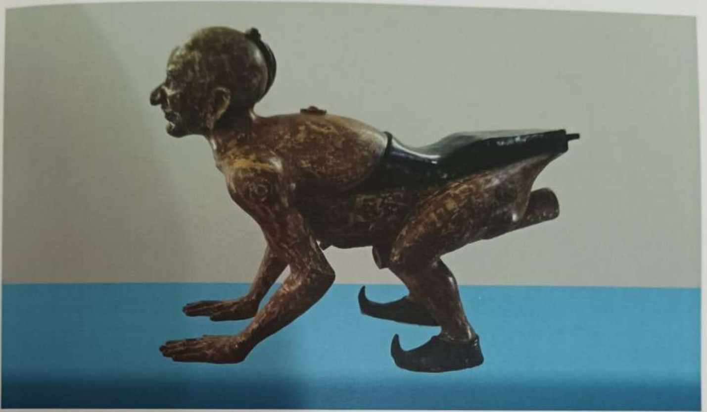
Fibreglass | 75 x 120 x 45 cm