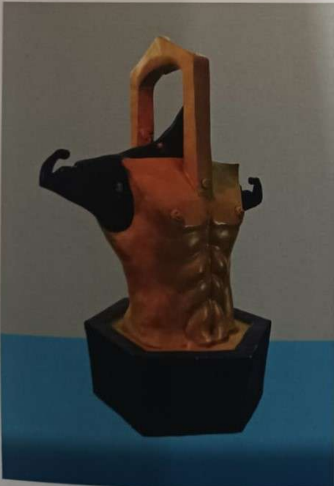
Fibreglass | 75 x 60 x 30 cm