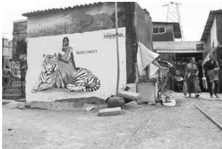
Figure 2 Priya Shakti wall mural