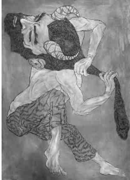
Figure 4 Juggernaut by sahej rahal

observing through an application, elements such as the tail, eyes, hands, and legs are visible moving. That is how alternative civilizations are represented. This artwork is a one-of-a-kind revolutionary work of contemporary art due to its powerful visualisation of shapes, colours, and forms, as well as its use of technology.